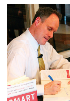
Stephen MR Covey Author (2012 Speaker)

For more information, visit OKEthics.org .