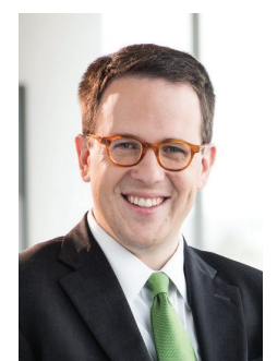
G.T. Bynum Tulsa Mayor (2017 Speaker)