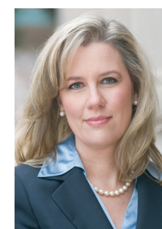
Cynthia Cooper WorldCom Whistleblower (2014 Speaker)