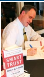
Stephen MR Covey (2012 Speaker)