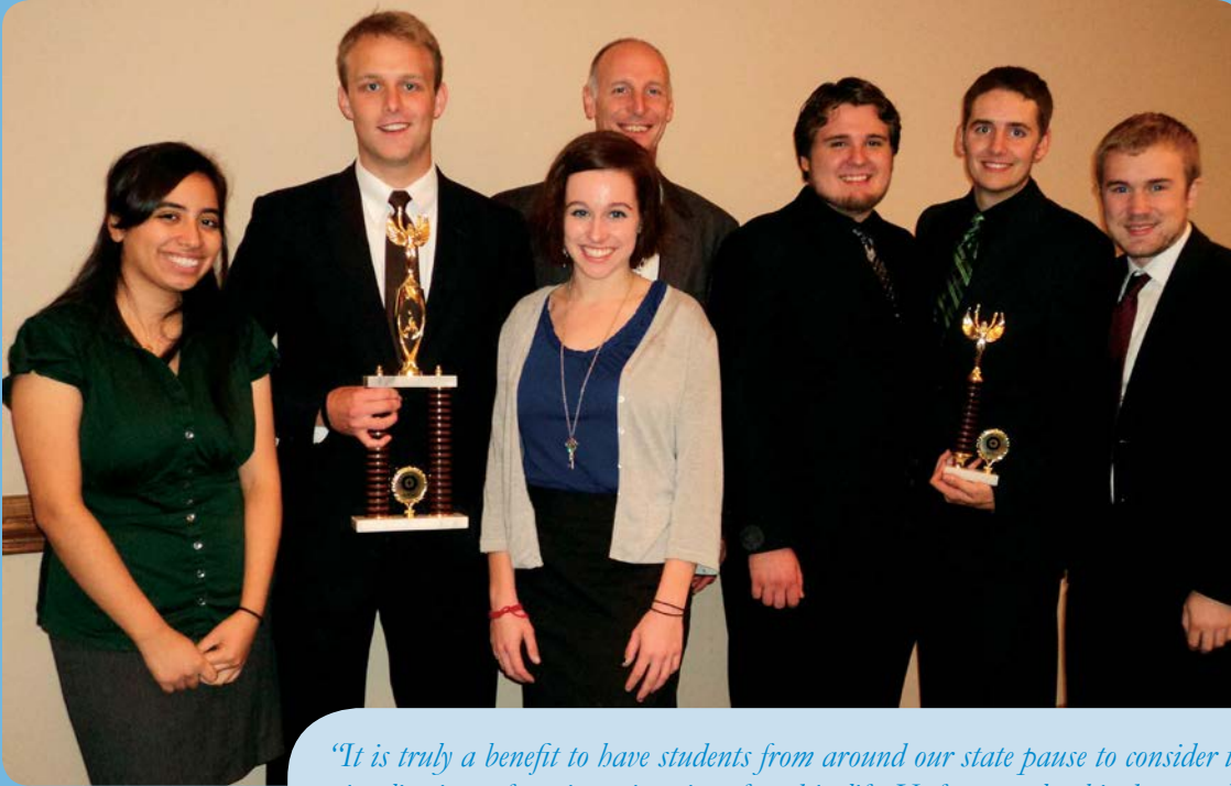
Members of the Oklahoma Christian University Ethics Teams (from left to right):